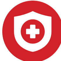
Medical & Healthcare