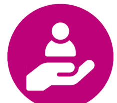
Recovery & Rehab