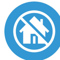
Homeless & Differently Abled