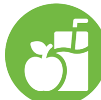
Food & Nutrition