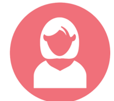
Women & Widows